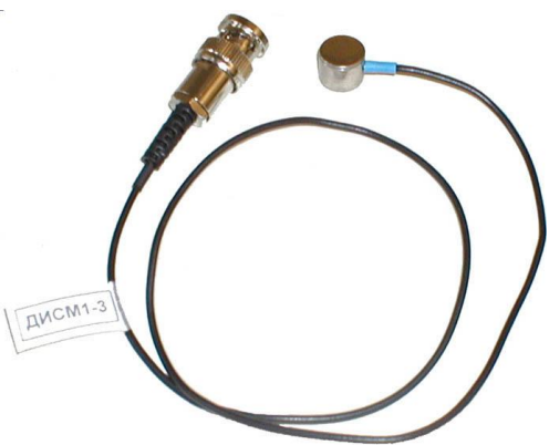
Fig. 2. Exterior view the AE sensor

Input R, Ohm 2.3 \cdot 1011 Range, MHz 0.3 \cdot 1.2 irregularity of the AFC dB 8.5 sensitivity, mV/m·s<sup>-2</sup> 125 capacity, nF 1.45